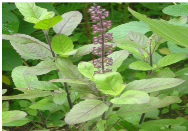
Fig 1 : Ocimum sanctum (Tulsi)

It's all about how the root, stem, leaves, branches, flower, fruit and seeds of a plant look. Morphology is the study of the plant's exterior appearance. According to Tulsi plant morphology, this is how it looks[13]: