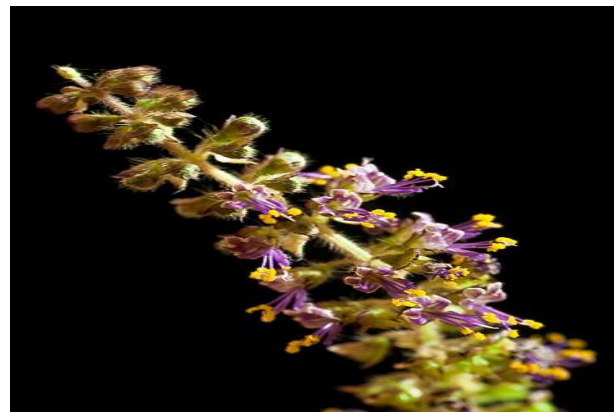
Fig 3 : Flowers of Ocimum sanctum