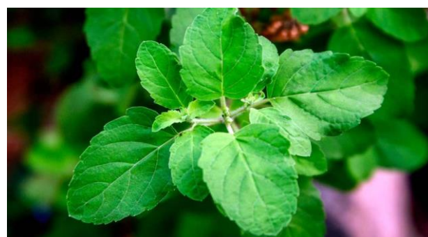
Fig 2 : Leaves of Ocimum sanctum

long and hairy, with an aromatic perfume and peculiar flavour.. Pedicels of the flower are longer than the calyx, and the calyx is ovoid or campanulate, 3-4 mm bilipped; upper lips are broadly oblong or suborbicular, shortly apiculate, while lower lips that are 170 longer than upper have four mucronate teeth, the central two largest; corollas are about 4 mm long, pubescent and aromatic; having aromatic odour and pungent flavour; and a nectar-like nectar. Subglobose or broad-elliptic and slightly compressed; pale brown or reddish, with minute black marks at the thalamus, aromatic and powerful in flavour are the four nuts in this fruit. It is brown, mucilaginous, 0.1 cm long, slightly notched at the base, and has a pungent, mucus-like flavour when soaking in water[14-16].