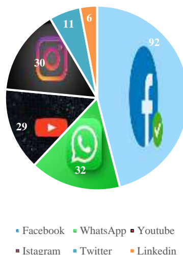
Social Media Stats in Ahmad Aba Distrcit - October 2021

Table 4 present just a small example there numerous pages and groups which help enhance agricultural extension. The considerable point is that the huge number of followers indict the big interest of the audience in receiving agricultural information through social media.